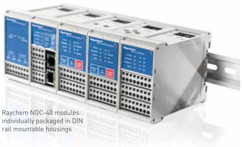
Raychem NGC-40 modules individually packaged in DIN rail mountable housings

The Raychem NGC-40 control system offers a truly modular heat-tracing control, monitoring and power distribution system. The system is fully flexible from a configuration point of view and offers individual single-phase and three-phase electrical heat-tracing controllers. Input / Output (I/O) modules provide additional expansion