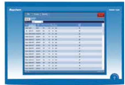
Touch 1500 15" touch screen display

full flexible configuration of the heat-tracing control system. Each heat-tracing circuit controller has its own processor and is therefore independent of other elements in the chosen system configuration. The Raychem NGC-40 offers heat-tracing controllers specifically designed for single-phase and three-phase systems. The controllers contain specific heat-tracing functionality which enables optimization of the operations and maintenance cost of the heat-trace installation. Additional I/O modules enable the possibility to extend the heat-tracing control with digital inputs and additional temperature control.